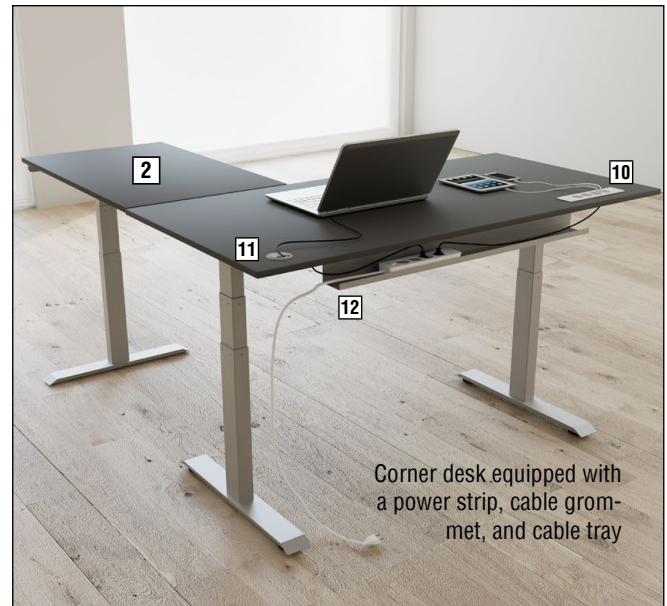
Corner desk equipped with a power strip, cable grom- met, and cable tray