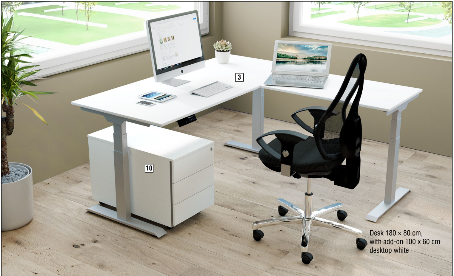
Desk 180 × 80 cm, with add-on 100 × 60 cm desktop white