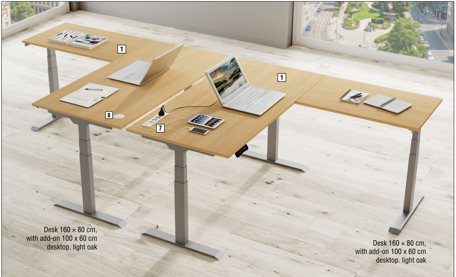
Desk 160 x 80 cm, with add-on 100 x 60 cm desktop. light oak