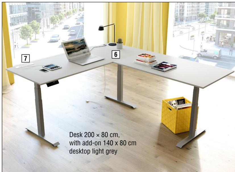
Desk 200 × 80 cm, with add-on 140 × 80 cm desktop light grey